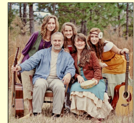
Stone Family Band

Make plans now to spend the weekend with us at the "301 MusicFest", in Florida's premiere RV Park and Entertainment Complex in Waldo, FL featuring a variety of music genres for all!